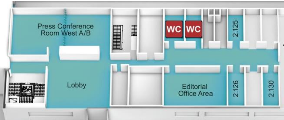
Floor plan Press Center East, 2. floor: