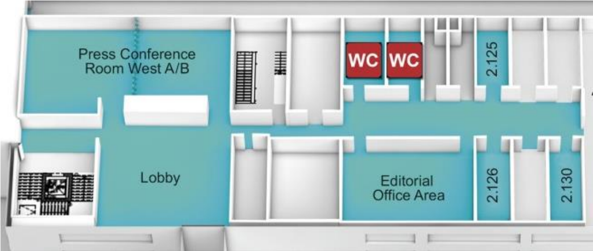
Floor plan Press Center East, 2. floor: